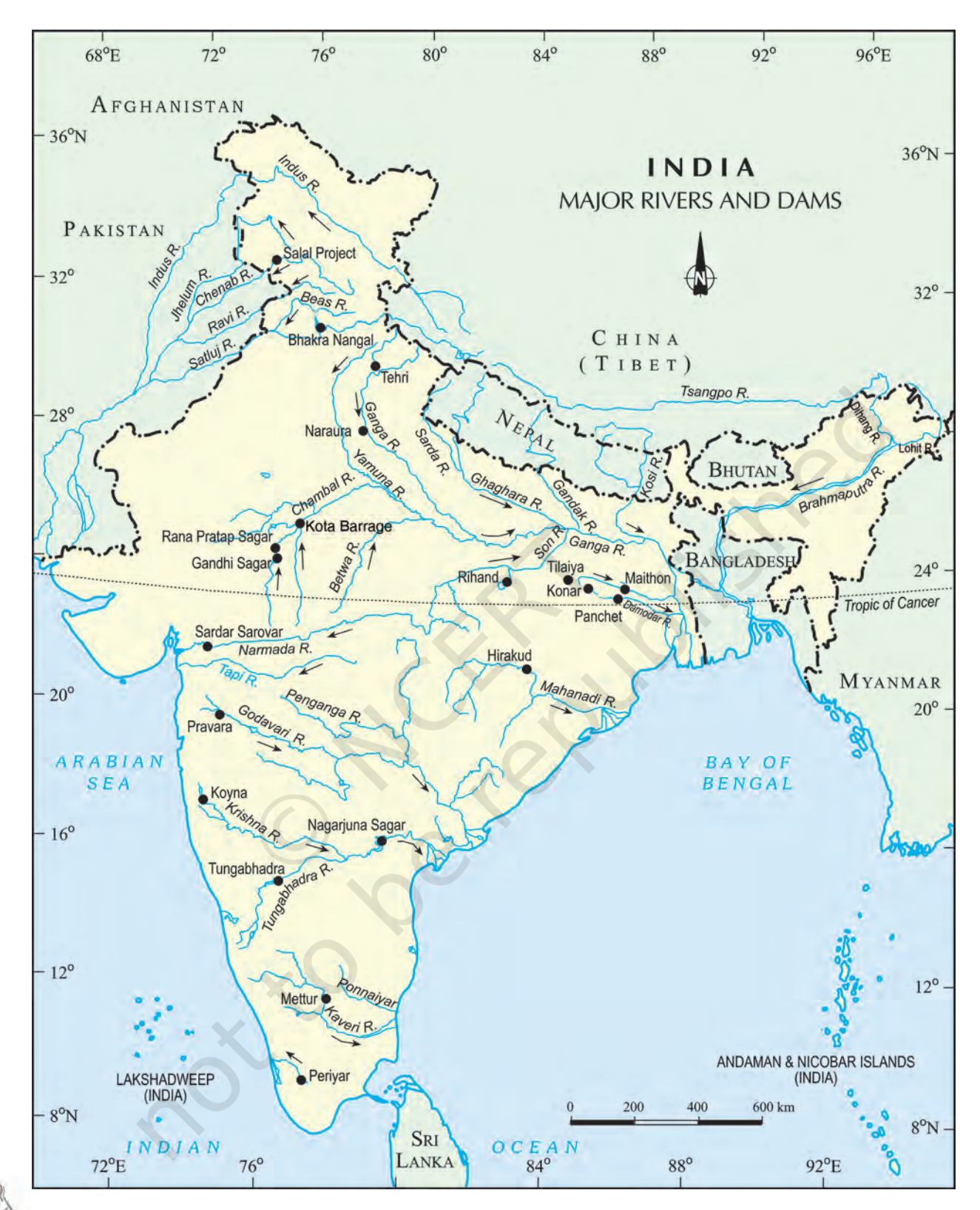
India: Major Rivers and Dams