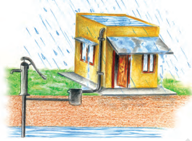
(a) Recharge through Hand Pump

system and were built inside the main house or the courtyard. They were connected to the sloping roofs of the houses through a pipe. Rain falling on the rooftops would travel down the pipe and was stored in these underground 'tankas'. The first spell of rain was usually not collected as this would clean the roofs and the pipes. The rainwater from the subsequent showers was then collected.