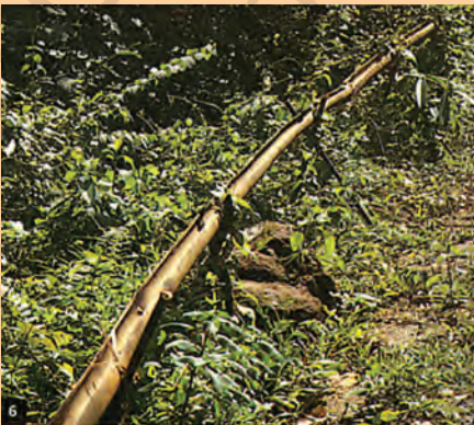
Picture 5 and 6 Reduced channel sections and diversion units are used at the last stage of water application. The last channel section enables water to be dropped near the roots of the plant.