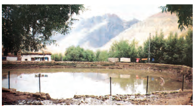
A kul leads to a circular village tank, as the above in the Kaza village, from which water is released as and when required.

The rainwater can be stored in the tankas till the next rainfall making it an extremely reliable source of drinking water when all other sources are dried up, particularly in the summers. Rainwater, or palar pani, as commonly referred to in these parts, is considered the purest form of natural water. Many houses constructed underground rooms adjoining the 'tanka' to beat the summer heat as it would keep the