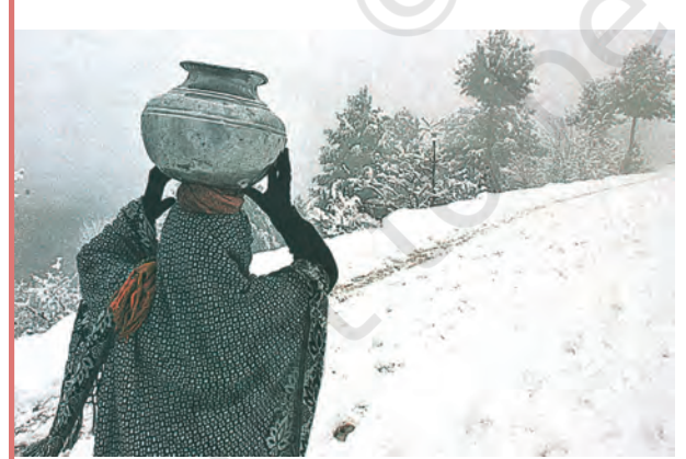
A Kashmiri earthquake survivor carries water in the snow in a devastated village.

Water, Water Everywhere, Not a Drop to Drink: After a heavy downpour, a boy collects drinking water in Kolkata. Life in the city and its adjacent districts was paralysed as incessant overnight rain, meaning a record 180 mm, flooded vast area and disruted traffic.