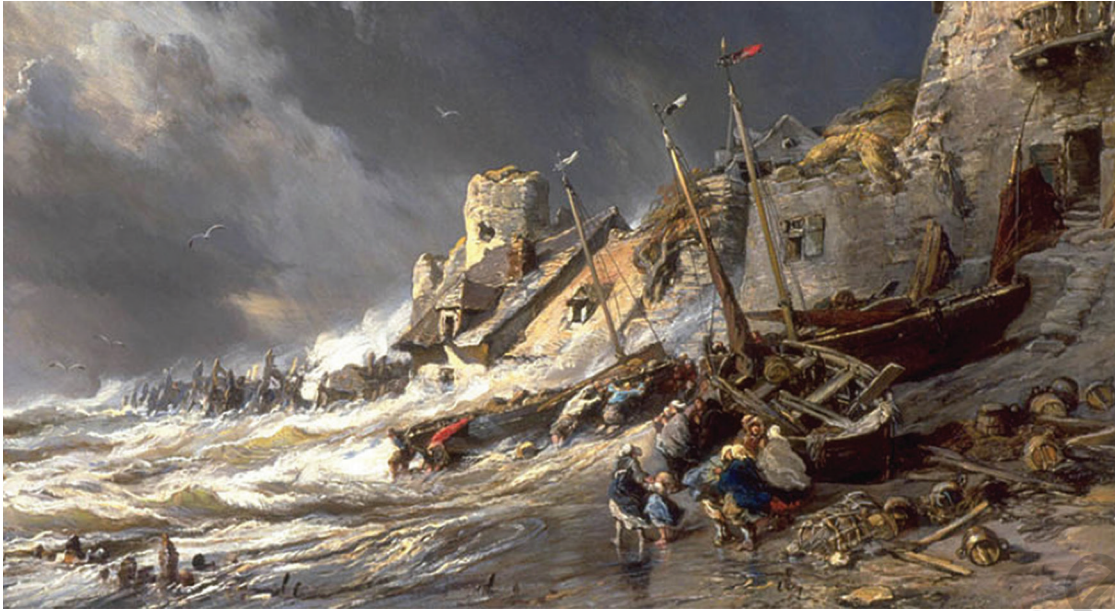
Figure 1.1: Coast Scene Source: https://goo.gl/ZsTCaq

Technology refers to methods, systems and devices, which are a result of scientific knowledge, being used for practical purposes. For example, Muskan went to an excursion to Bhubaneswar and visited the State Museum. She saw various mineral ores in the mineral section of the museum. She decided to capture photographs to share with others who may not have seen the ores. She borrowed her teacher's mobile and clicked pictures of the rare collection. She shared all the pictures on her blog along with a description of the ores. Many viewers commented and appreciated Muskan for sharing those pictures and description.