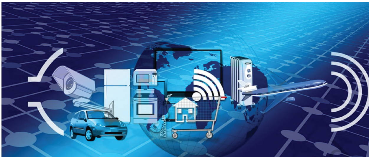
Figure 1.2: ICT Around Us

digital television. In addition to printed newspapers now we also have their electronic versions. Along with traditional radio, we also have online radio.