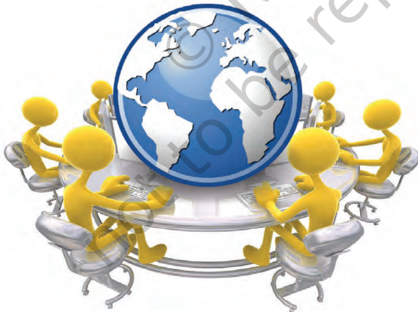
Fig. 7.1: Cyber World

Since childhood our parents and elders have been guiding and suggesting us to take care of our eating habits, practice hygiene, be wary of strangers, communicate effectively and so on to ensure that we develop into confident, strong and positive individuals who are able to cope up with the competition and complexities of the real world. With the advent of