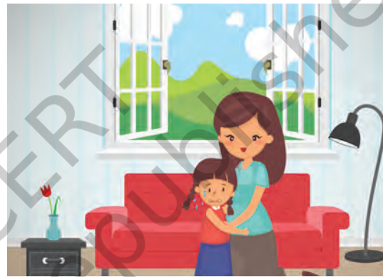
Fig. 7.6: Talk about it

Cyber bullying may affect you in many different ways. Don't feel that you are alone. Let your parents and teachers know what is going on. Never keep it to yourself.