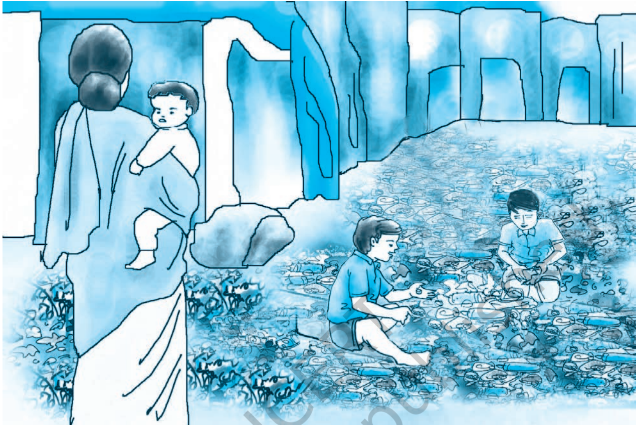
Fig. 10.3 : Children playing with waste material

Through this activity you will be surprised to find that many of the items that have been discarded by you, still have utility. On the other hand, there are certain wastes, such as wet waste (kitchen waste), which can be reduced to almost 'zero waste'. Let us now discuss how we can reduce the volume of solid waste and garbage, by practising waste management and segregation through the principles of "reuse, recycle, reduce and refuse."