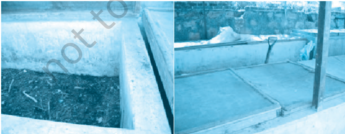
Fig. 10.5 Compost Pit prepared by Bethany Society, Shillong, Meghalaya

Often you may have come across persons (the Kabariwalas ) who visit our home, and to whom we sell old newspapers, magazines, bottles, tins, etc. Maybe, you have never thought where these products go, and what happens to them. These products are utilised as raw materials for manufacturing other products. In other words, these products are recycled . This is actually an important effort, as in this process, we not only reduce the load of garbage, but also conserve natural resources. Some of the common items that can be recycled are