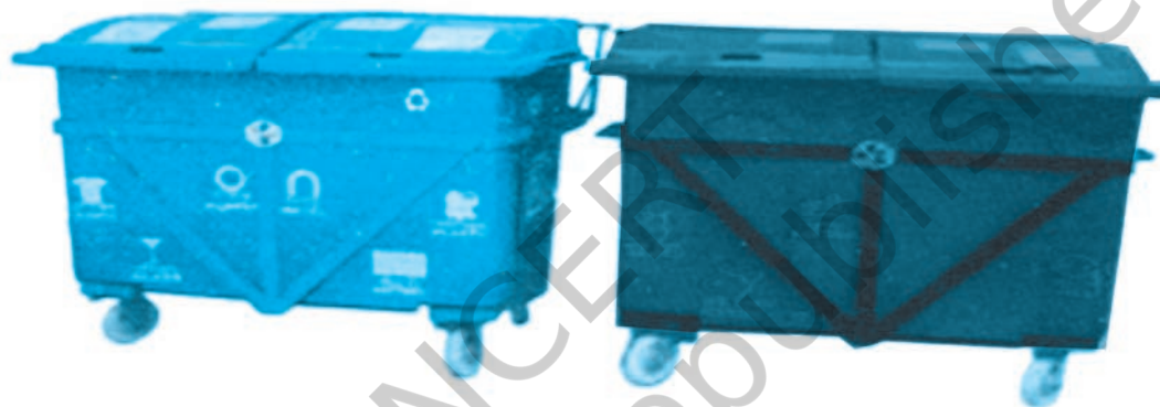
Fig. 10.4 : Blue and Green Bins

In the cities we find these bins in some places, where people can dispose of biodegradable and non-biodegradable garbage separately. Where do you think we should dispose of hazardous waste? Should there be a separate bin for it? Why?