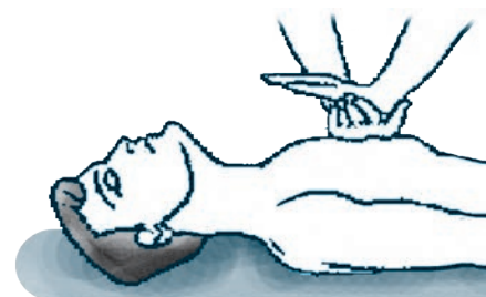
Fig. 12.2 : Steps for CPR in the case of drowning