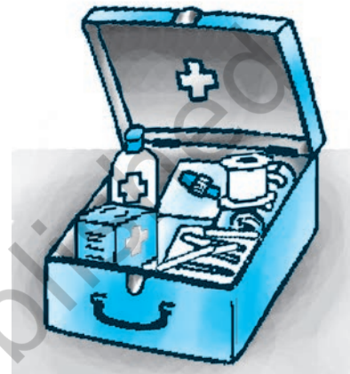
Fig. 12.1 : First Aid Box

Having studied first-aid, you are prepared to give others some instruction in first-aid, to promote among them a reasonable safety attitude and to assist them wisely if they are stricken. There is always an obligation on a humanitarian basis to assist the sick and the helpless. There is no greater satisfaction than that resulting from relieving suffering or saving a life.