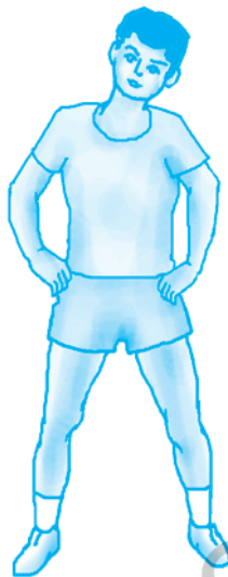
1. Head tilt (side to side)

Warming Up: Muscle stiffness is thought to be directly related to muscle injury and therefore, the warming up should be aimed at reducing muscle stiffness.